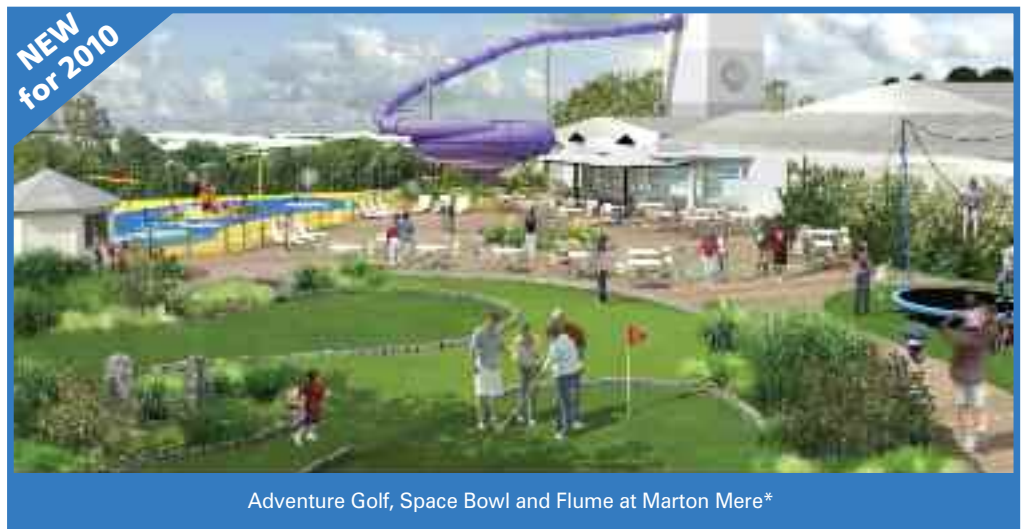
Adventure Golf, Space Bowl and Flume at Marton Mere*

£12million will be spent on new accommodation. Haven offer a wide choice of holiday homes to suit all styles and budgets from the luxurious 'Exclusive' and 'Platinum' range to the comfortably appointed but more