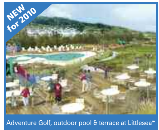
Adventure Golf, outdoor pool & terrace at Littlesea*