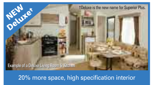
20% more space, high specification interior

economic 'Standard' and 'Superior' caravans. And several venues will be treated to a makeover including the ShowBars at Lakeland, The Orchards and Quay West. Exterior terraces and decking areas will be a feature on a number of Parks so guests can relax over a drink and a meal whilst enjoying the views. It's all about exceeding guest expectations. Our Parks are in stunning locations but that's not enough. We need to provide a complete experience that includes first class facilities, comfortable and welcoming accommodation, a wide range of activities and excellent entertainment as well.