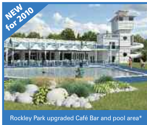
Rockley Park upgraded Café Bar and pool area*